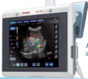
Articulated arm attachment